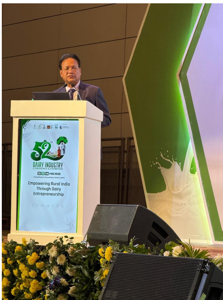
Delivering Prof. M.R. Srinivasan Memorial Lecture at 52nd Dairy Industry Conference & Exhibition, New Delhi